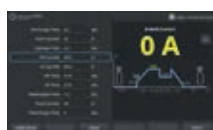
Interface Manual welding