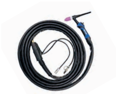
Gas-cooled TIG manual torch with 6 m hose package (optional)