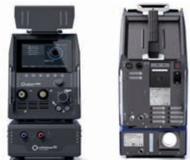
MOBILE WELDER OC PLUS Front and rear view

parts - one power source for all challenges in modern tube installation.