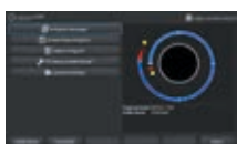
Interface Orbital welding