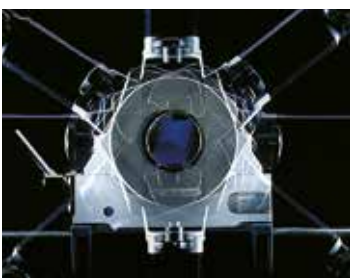
Optional with feeding module AVM or MVM