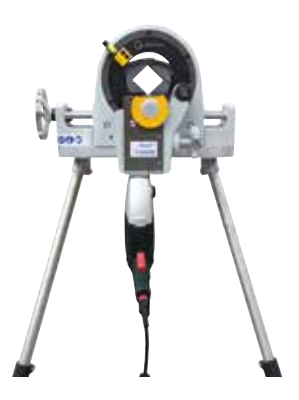
PS 4.5 Plus