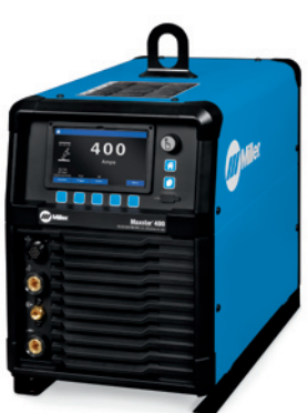
Maxstar 400 machine only

Allows for any input voltage hookup (208-600 V) with no manual linking, providing convenience in any job setting. Ideal solution for dirty or unreliable power.