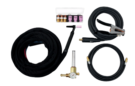
301268 kit shown.