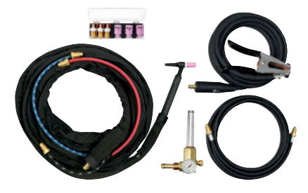
300990 kit shown.